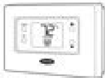
Fig. 1 - Comfort Pro Non-Programmable Thermostat

There is a label on the thermostat that contains important information. Read the label carefully. The label contains information about the thermostat's features, limitations, and safety warnings. It also contains information about the thermostat's warranty and how to contact Carrier for more information.